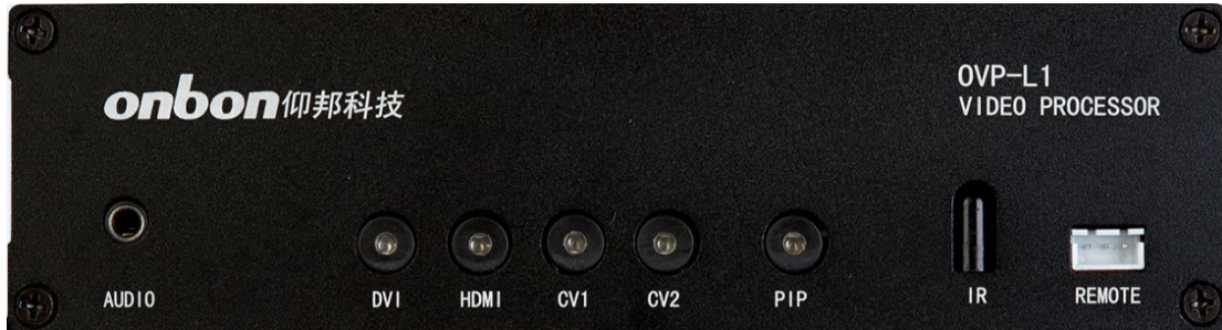
Photo of front side